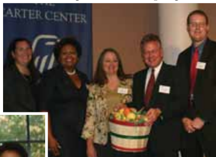
Nelson Mullins Riley & Scarborough team accepting apples of appreciation as the firm with the most completed interviews to date