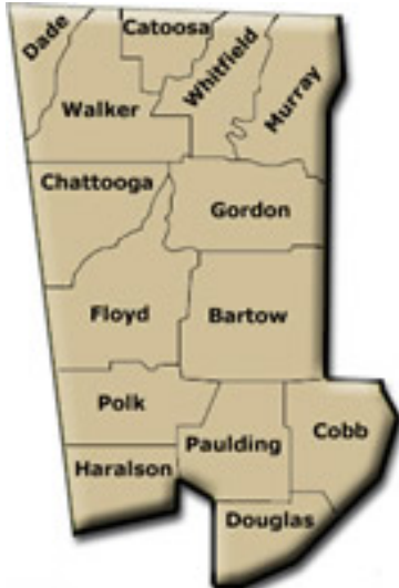
7 th Judicial District's Eight Judicial Circuits