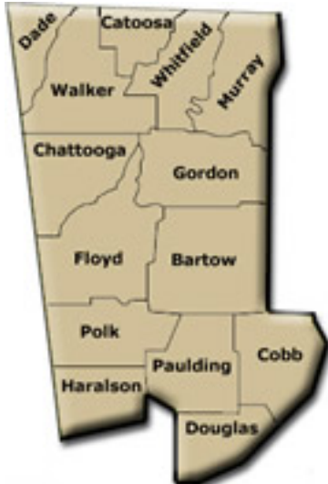
Seventh Judicial District